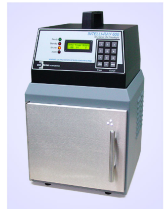
IntelliRay mounted on optional Rayven oven

The unit automatically reduces lamp power by one half when the shutter is closed. This reduces excessive heat and therefore increases life of system components, without the need to power down.